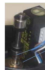
Target switch and cam for close valve