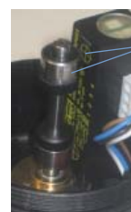
Target switch and cam for open valve

This signal is transmitted in accordance with the NAMUR standard on one version of the 1062 ATEX.